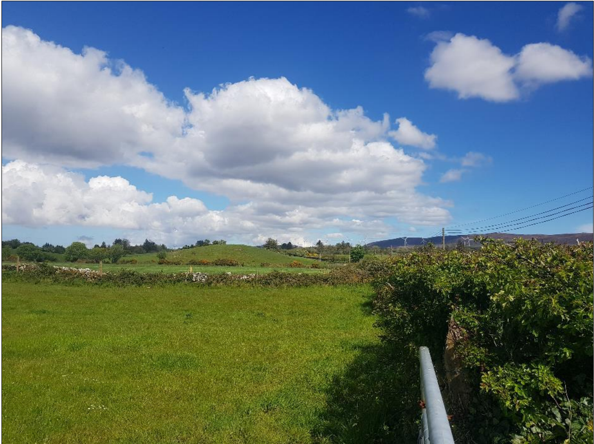
Plate 14.40 View towards NE/E east of area of unclassified megalithic tomb MA040-017--- (National Monument Ref. 293). Note drumlin terrain and partial glimpse views of existing windfarm turbines to right of image along Ox Mountain skyline view.