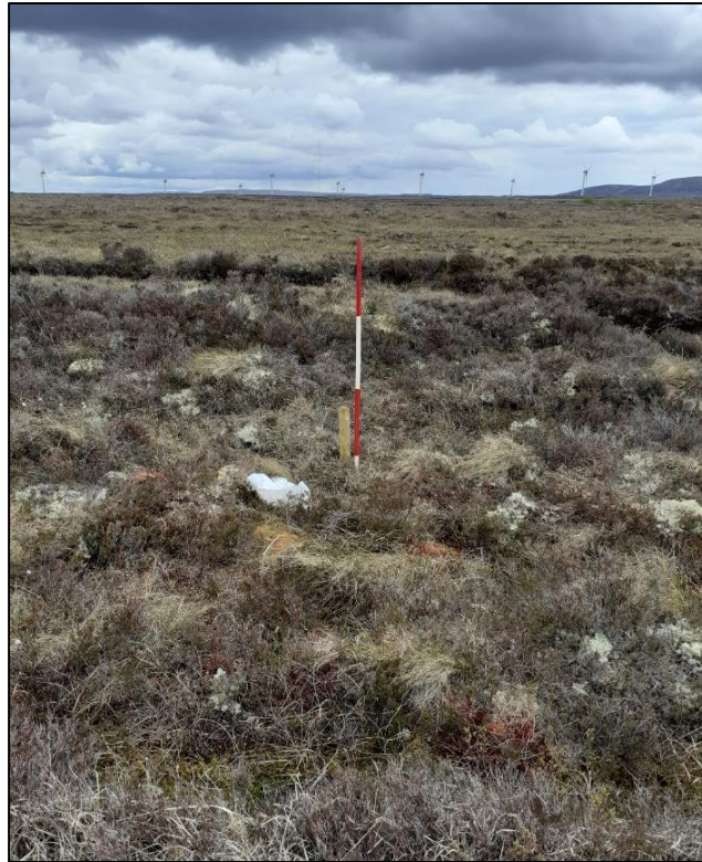
Plate 14.3: View of area of T3, facing east.