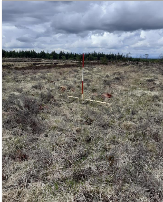
Plate 14.5: View of area of T5, facing south.