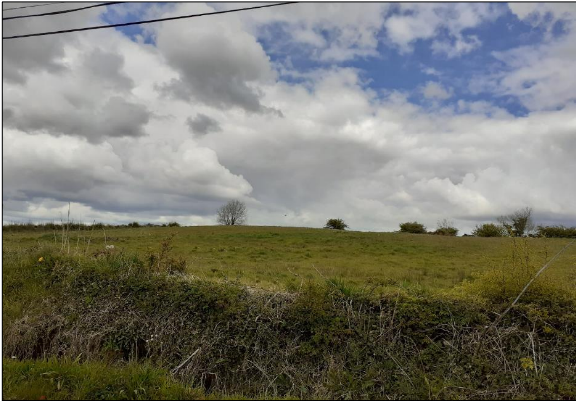
Plate 14.25: View towards Wind Farm Site from ringfort (MA031-047----) along local roadway, facing east.