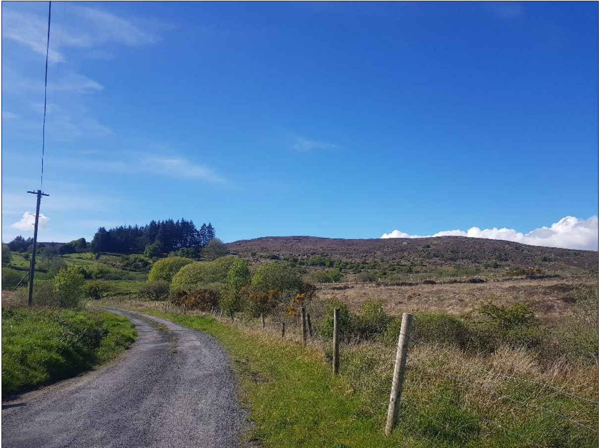
Plate 14.42 View towards N and area of court tomb SL036-003--- (Nat. Mon. Ref. 479) on slopes of the Ox Mountains (proposed Wind Farm Site not visible – on other side of Mountain ridge)