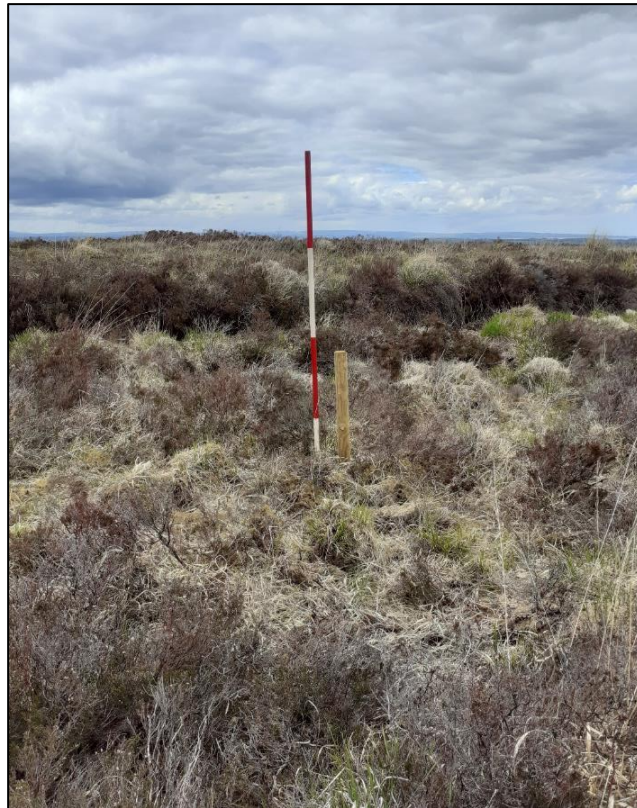
Plate 14.11: View of area of T11, facing north.