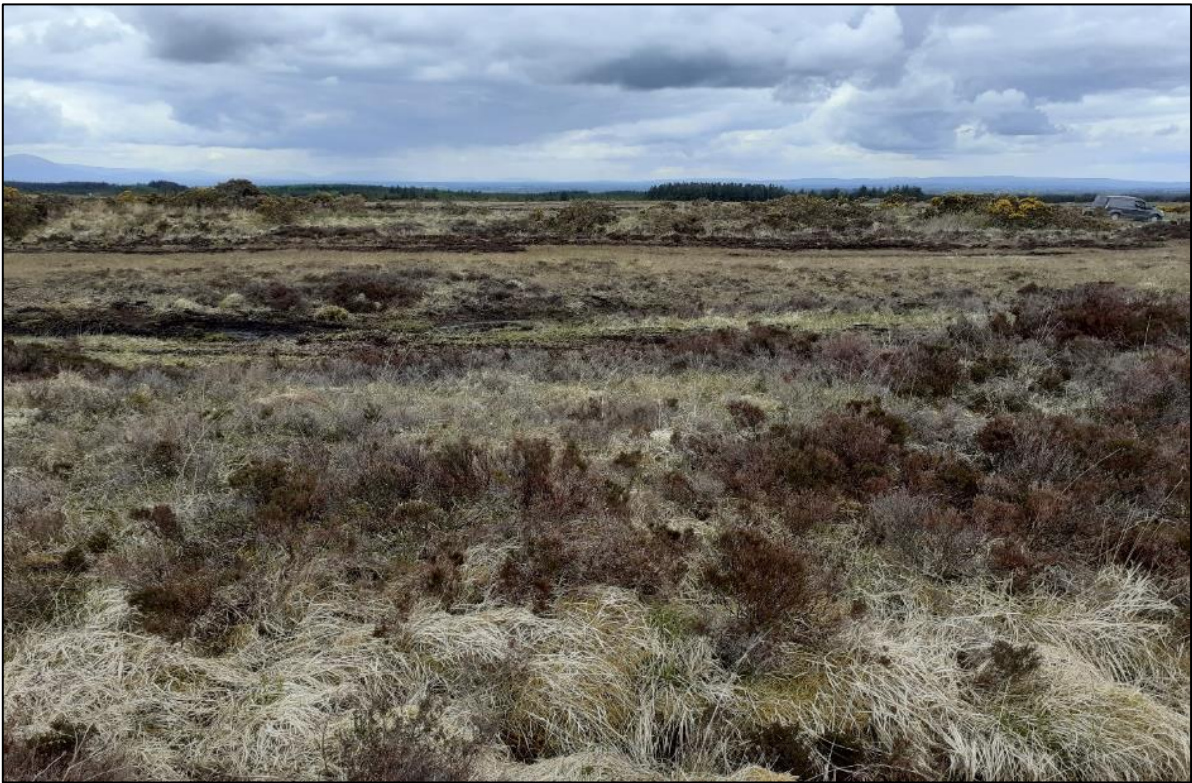
Plate 14.17: View from court tomb (MA031-034----), facing west.