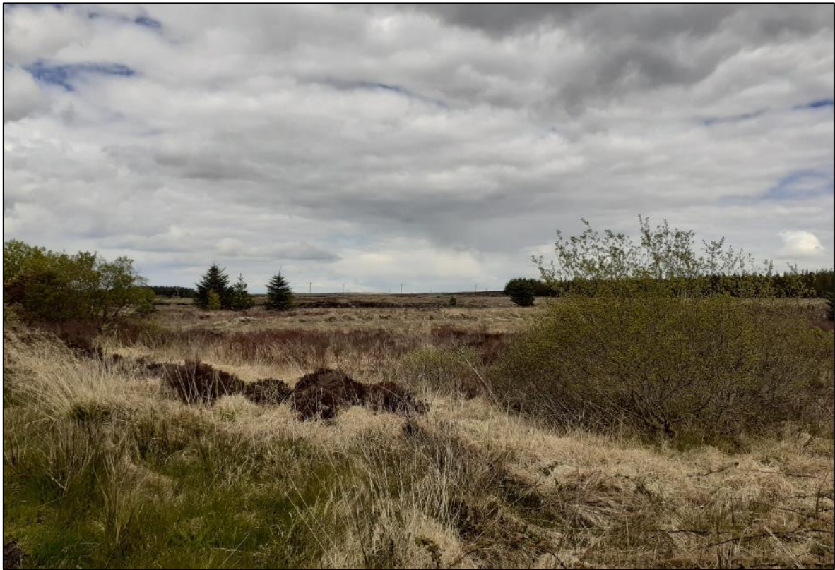
Plate 14.23: View from local road along western Wind Farm Site boundary at Carrownaglogh towards Wind Farm Site, facing northeast.