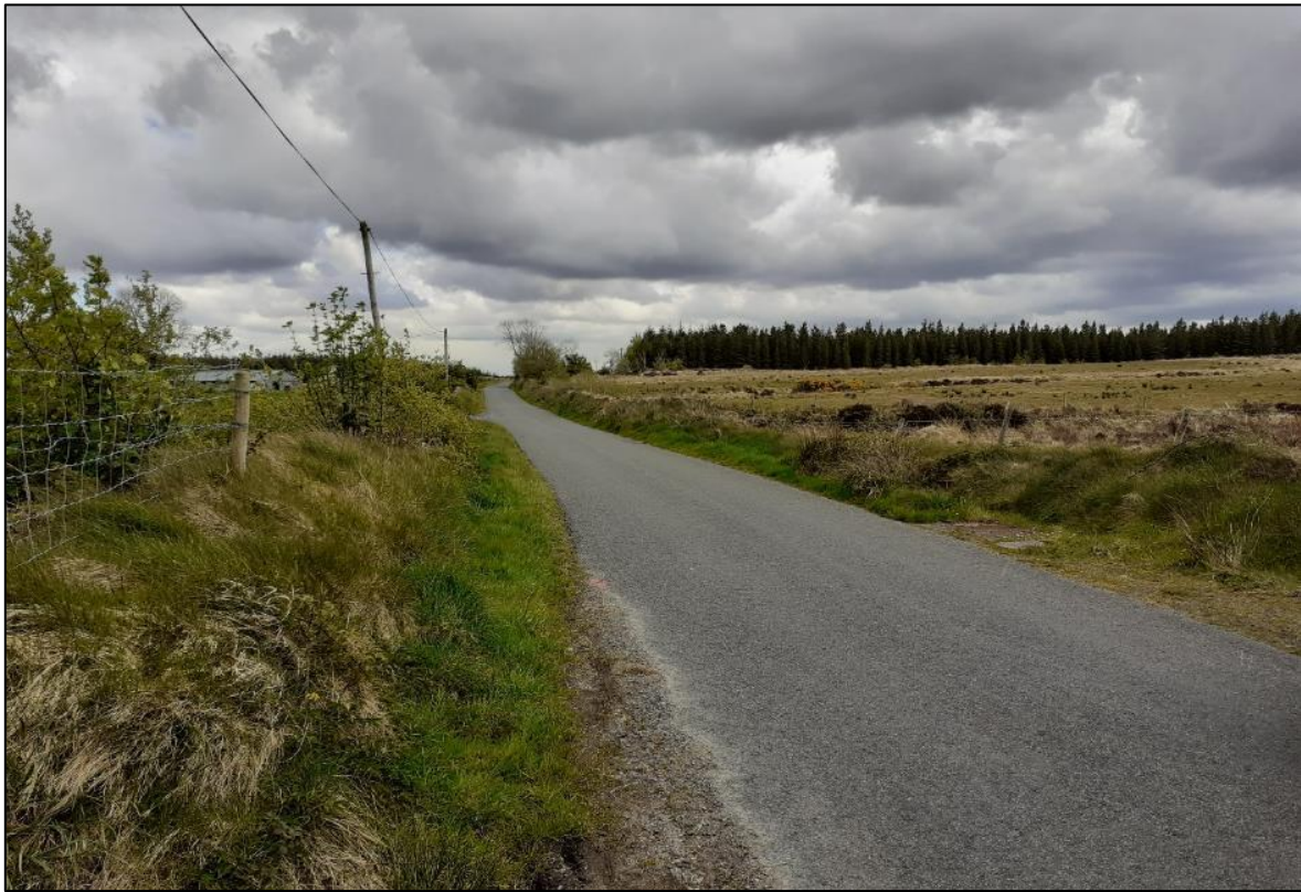
Plate 14.21: View towards Wind Farm Site from burial ground & souterrains (MA031-004001-), facing east.