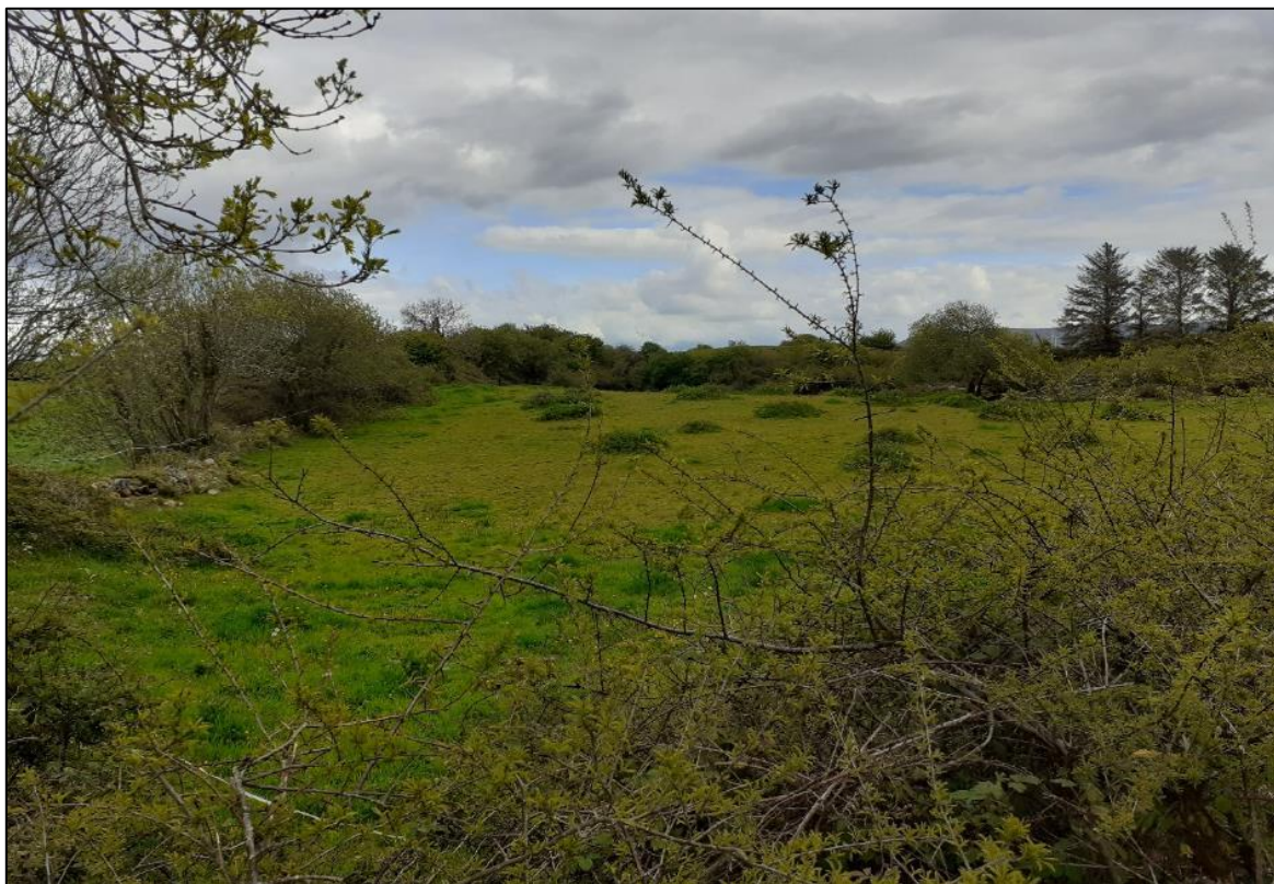
Plate 14.26: View towards ringfort and children's burial ground (MA031-023---- & MA031-023001-) from local roadway, facing east.