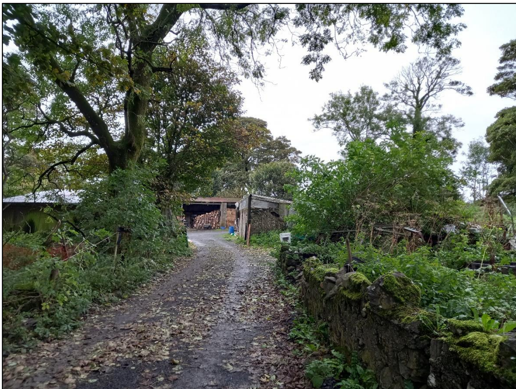
Plate 14.34: View towards northwest and roundabout/access road area to Hydrogen Plant Site