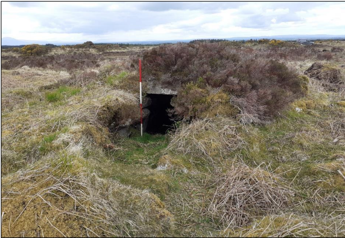
Plate 14.15: View of court tomb (MA031-034----) east facing entrance, facing west.