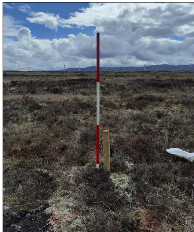
Plate 14.4: View of area of T4, facing east.