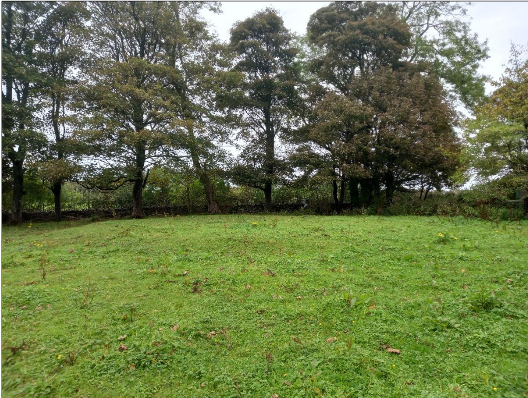
Plate 14.27: View towards barrow site SL022-026---, facing north.