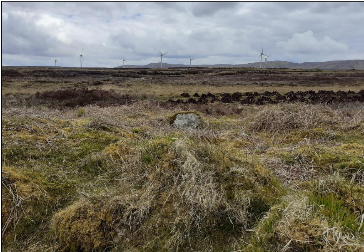
Plate 14.16: View from court tomb (MA031-034----) entrance, facing east.