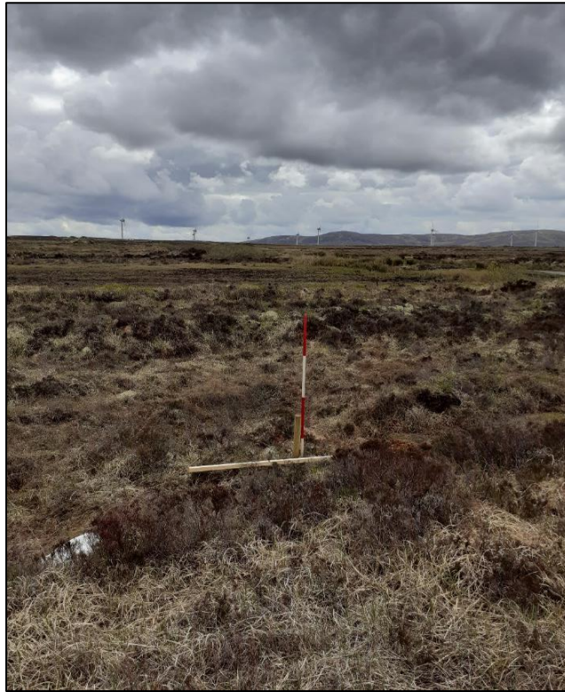
Plate 14.7: View of area of T7, facing southeast.