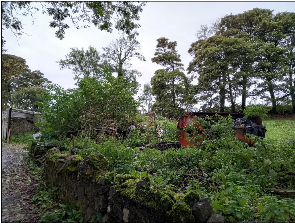
Plate 14.33: View towards northeast and roundabout/access road area to Hydrogen Plant Site