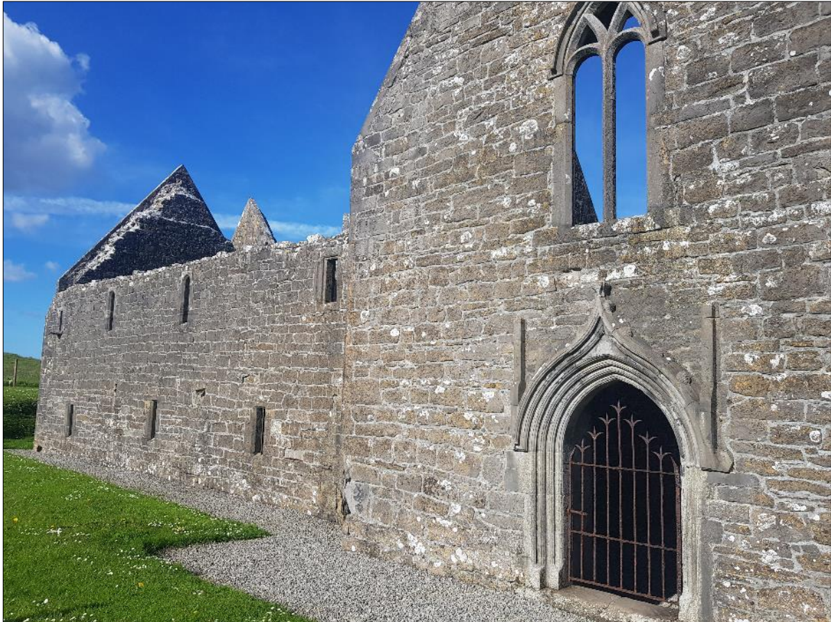
Plate 14.43 View of west elevation of Rosserk Abbey (Nat Mon Ref. 104)