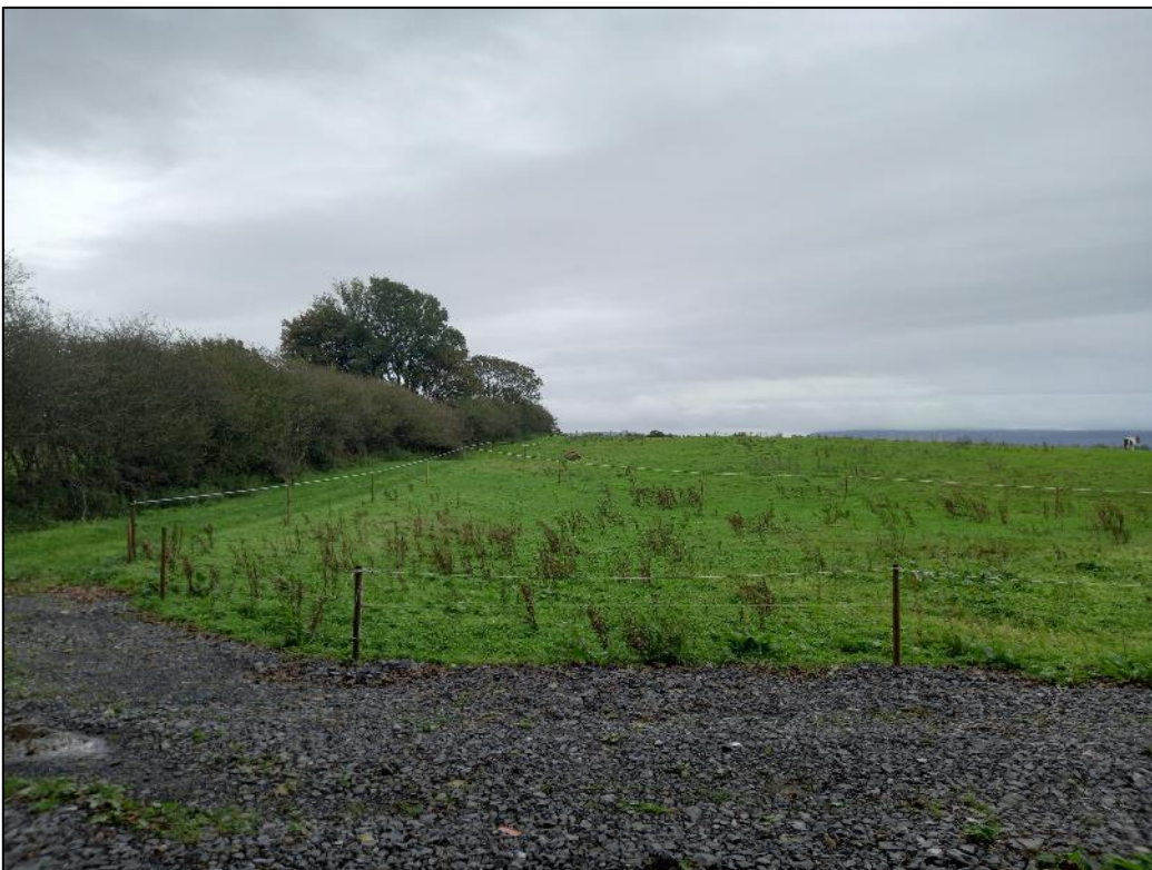
Plate 14.28: View towards east and access road to Hydrogen Plant Site (along field boundary).