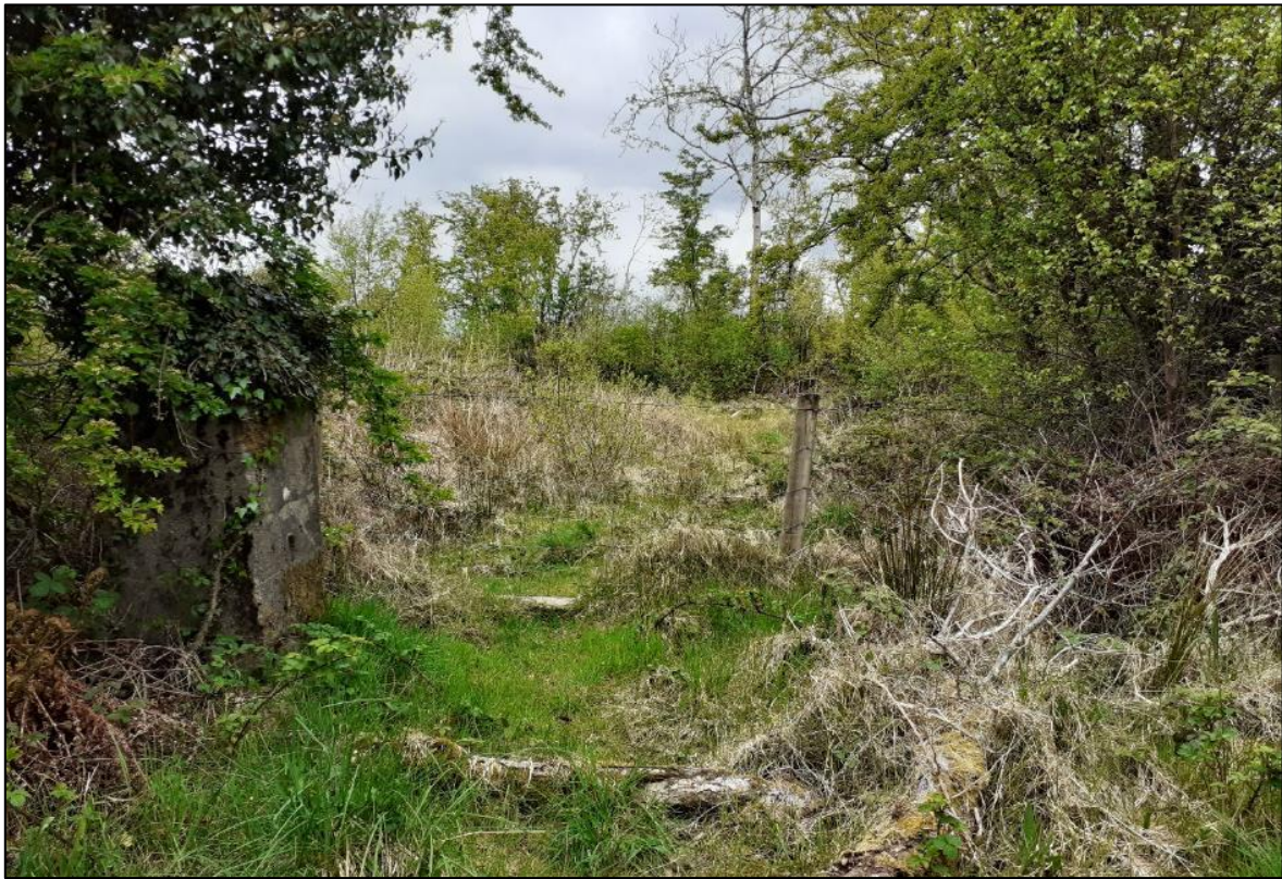
Plate 14.19: View of overgrown access to wedge tomb (MA031-005----), facing north.