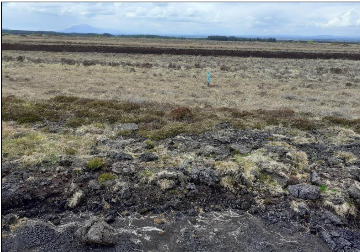
Plate 14.14: View of area of archaeological test trench 16 location (excavated 2011), facing southeast.