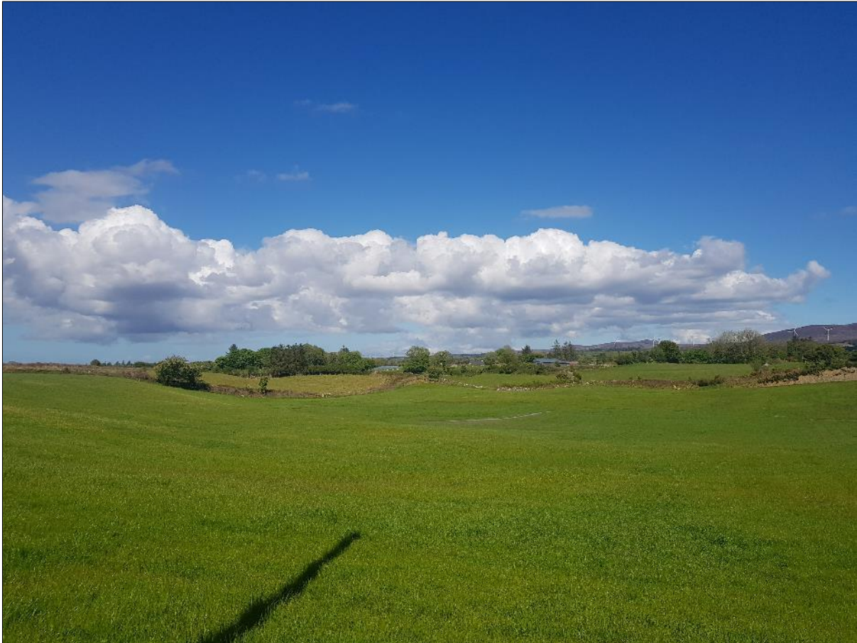
Plate 14.41 View towards NE and area of standing stone MA040-091--- (National Monument Ref. 293). Note undulating topography and mature tree-lined field boundaries with glimpse views of existing windfarm turbines to east of proposed Wind Farm Site.