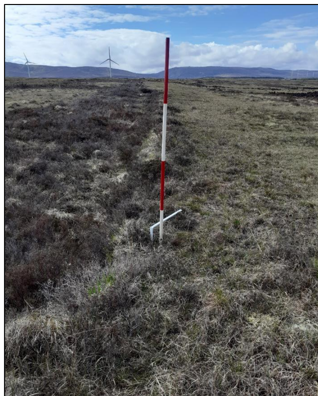
Plate 14.12: View of area of T12, facing southeast.