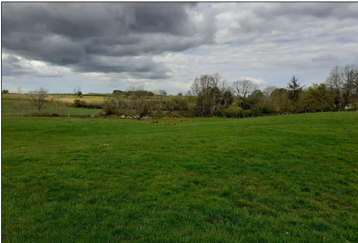
Plate 14.20: View of burial ground & souterrains (MA031-004001-), facing north.