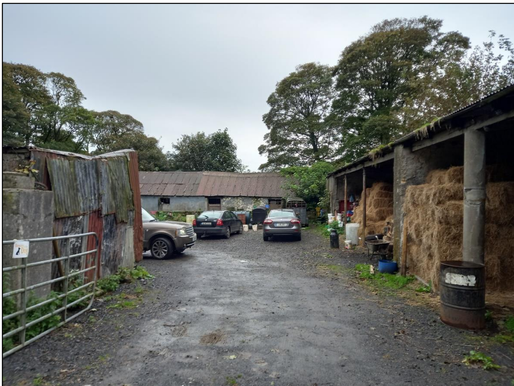
Plate 14.36: View towards south and existing domestic yard with outbuildings at access road area to Hydrogen Plant Site