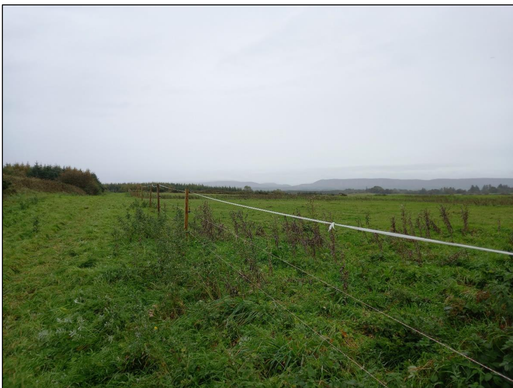
Plate 14.32: View towards east along proposed access road (left) and Hydrogen Plant Site (right)