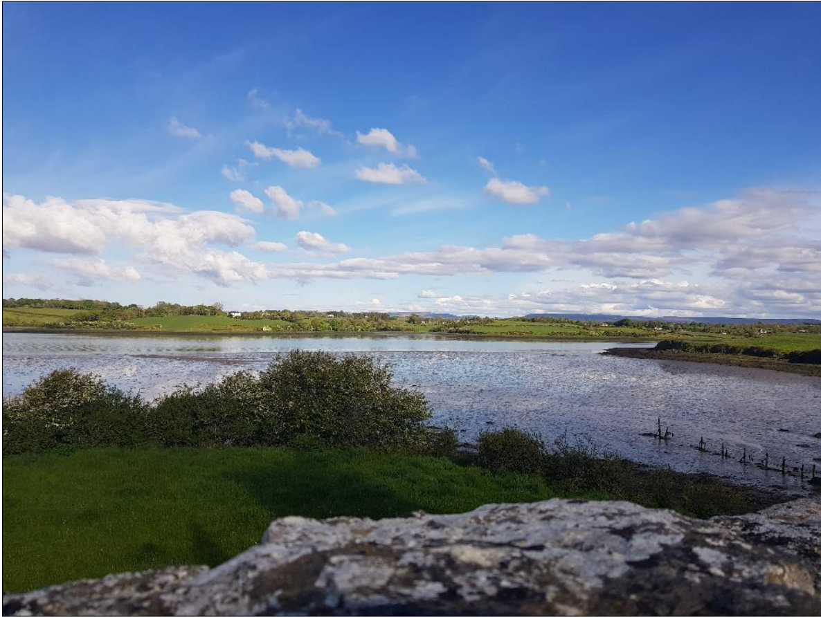
Plate 14.45 View towards SE and distance skyline of the Ox Mountains from top floor of Rosserk Abbey (Nat Mon Ref. 104). Very partial long glimpse views of existing wind turbines are visible.