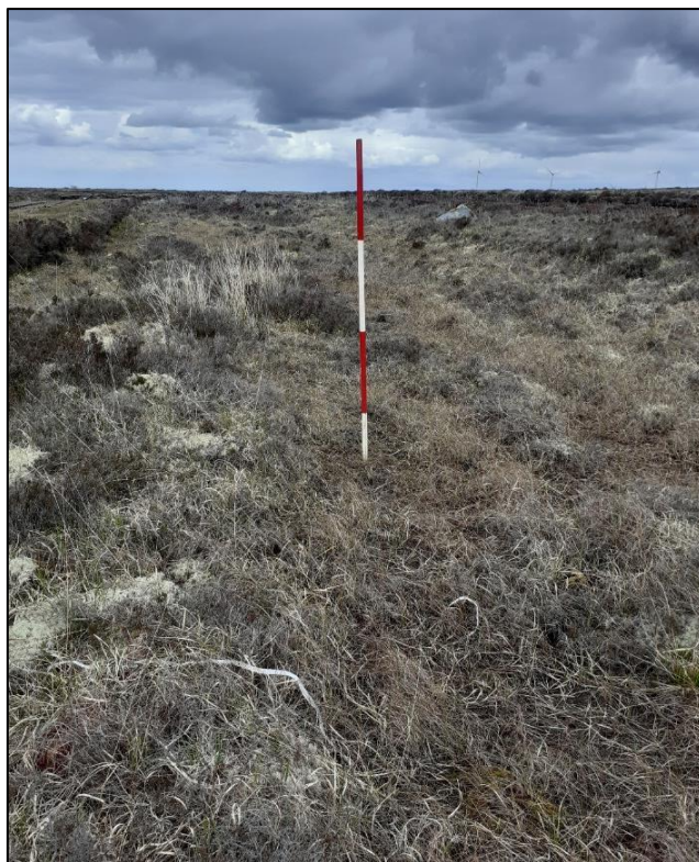
Plate 14.10: View of area of T10, facing northeast.