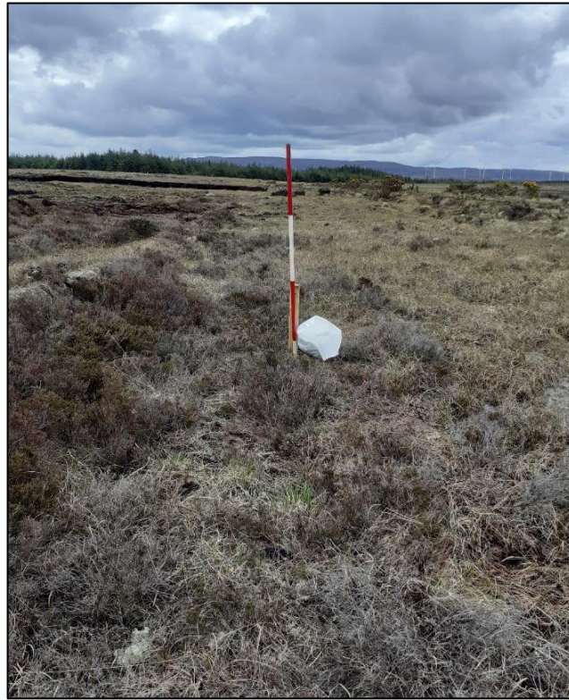
Plate 14.1: View of area of T1, facing northeast.