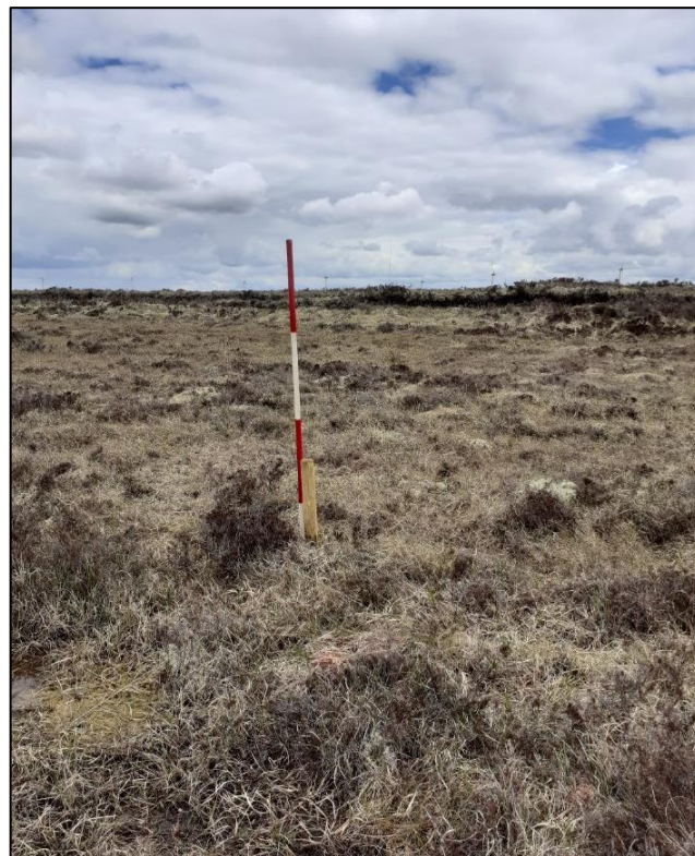
Plate 14.2: View of area of T2, facing northeast.