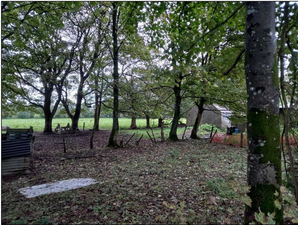
Plate 14.35: View towards south and roundabout/access road area to Hydrogen Plant Site