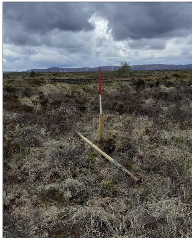
Plate 14.6: View of area of T6, facing southeast.