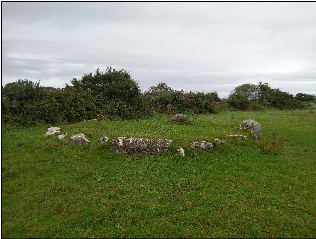
Plate 14.29: View towards northwest and remains of possible turf stand south of proposed access road to Hydrogen Plant Site