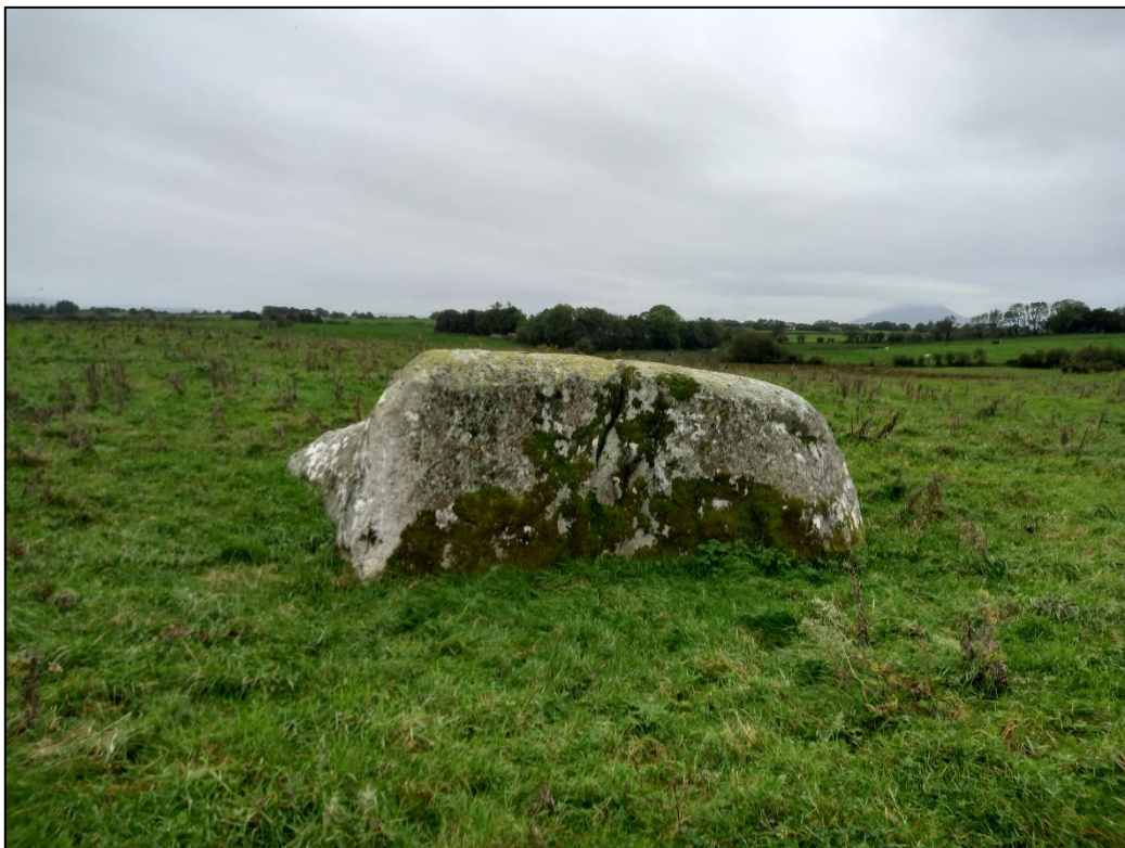
Plate 14.30: View towards southeast and rock outcrop with local folkloric association located south of proposed access road to Hydrogen Plant Site