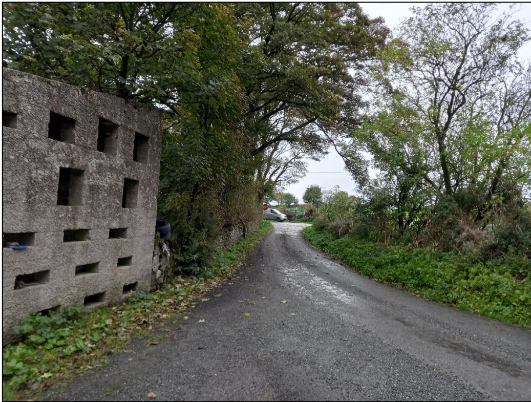
Plate 14.37: View towards northwest and Hydrogen Plant Site access road junction area with N59