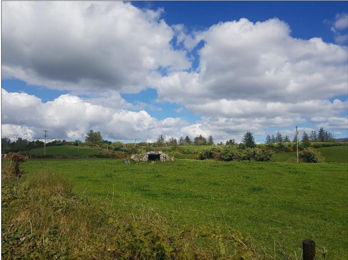
Plate 14.38 View to NE towards proposed Wind Farm Site and entrance of Carrowcrom wedge tomb (National Monument Ref. 293) MA040-019---. Note local rising topography and vegetation in this direction.