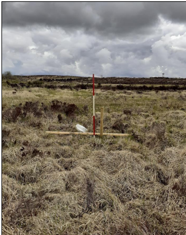
Plate 14.8: View of area of T8, facing east.