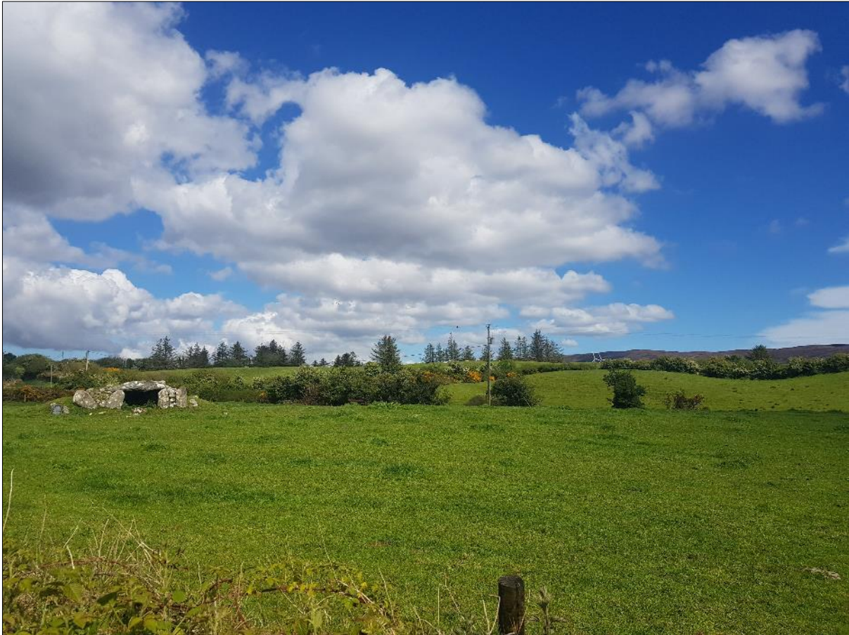
Plate 14.39 View towards NE/E and entrance of Carrowcrom wedge tomb (National Monument Ref. 293) MA040-019---. Note Ox Mountains forming part of skyline to right of image and glimpse view of blade tips of existing windfarm to the east of the proposed Wind Farm Site.