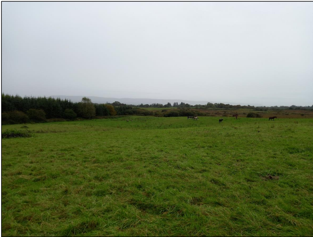
Plate 14.31: View towards south/southeast of proposed Hydrogen Plant Site