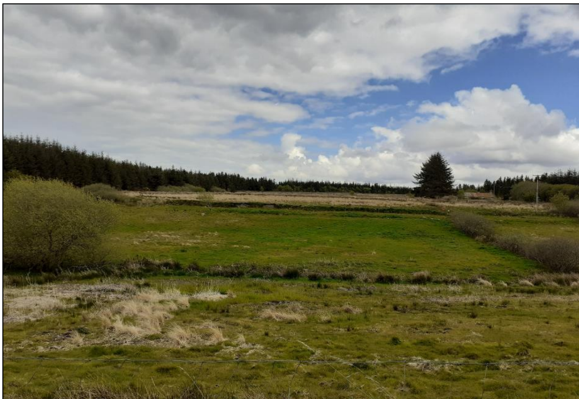
Plate 14.22: View from local road along western Wind Farm Site boundary, towards Wind Farm Site, facing east.