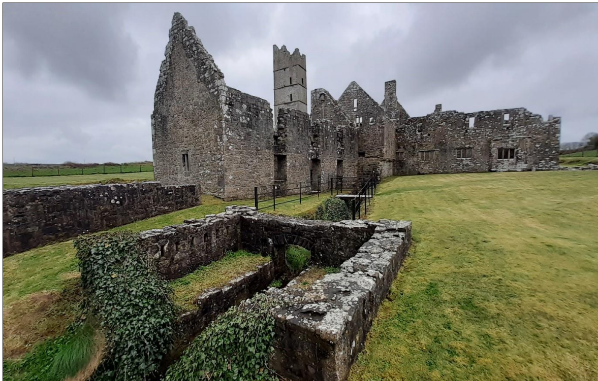
Plate 14.46 View towards west at Moyne Franciscan Friary (MA022-024001-) and 18 th Century House (MA022-024002-)