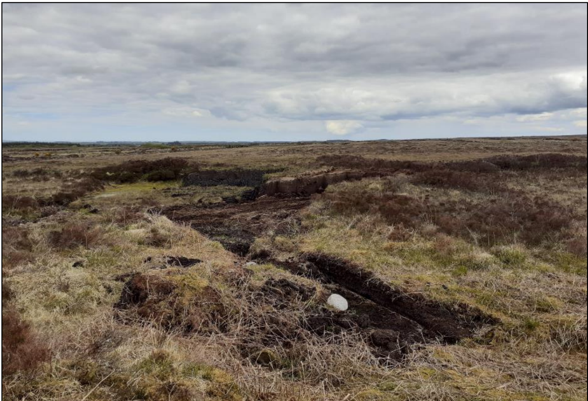
Plate 14.18: View of bog cutting close to court tomb (MA031-034----), facing northwest.