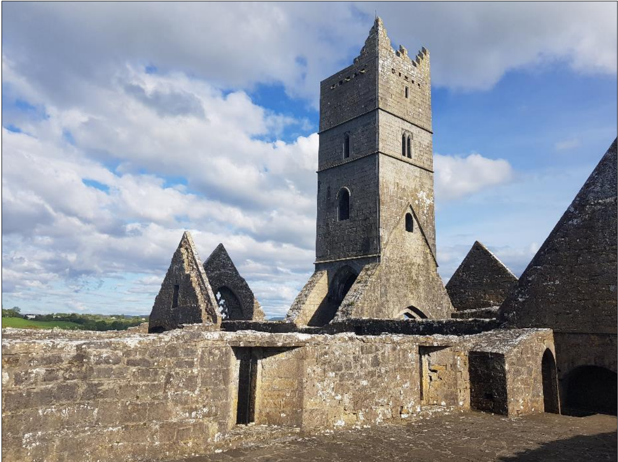
Plate 14.44 View of bell-tower and top floor interior of Rosserk Abbey (Nat Mon Ref. 104)