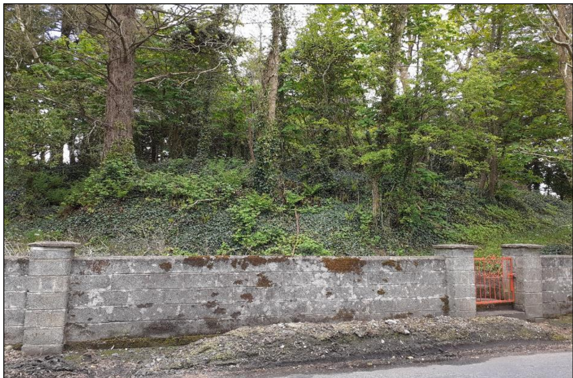
Plate 14.24: View of ringfort (MA031-047----) adjacent local roadway, facing east.