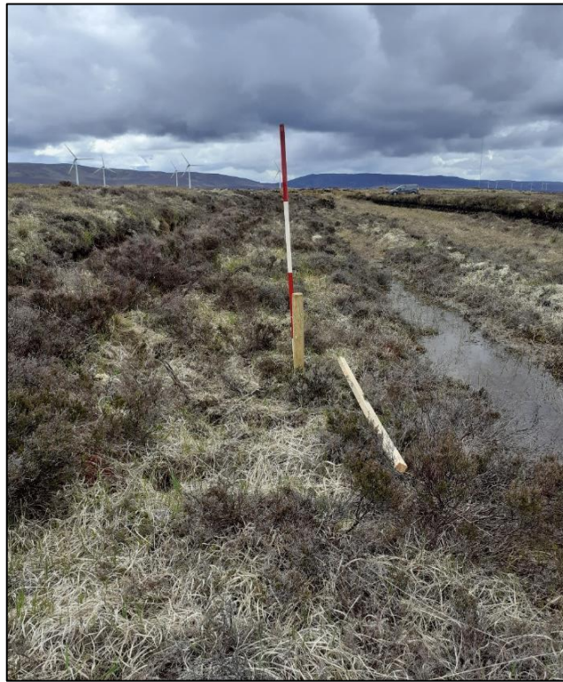
Plate 14.13: View of area of T13, facing south.